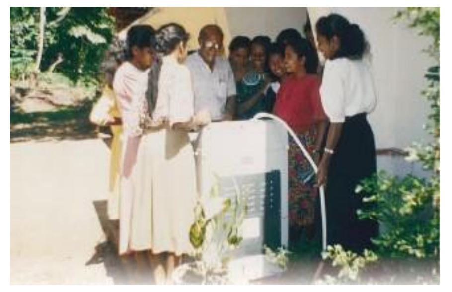
Demonstration in use of a washing machine given by Instructor to a group of prospective Migrants prior to Departure Migrant Worker Association Dehiwala

Industrial labor discipline and manners, labor security.